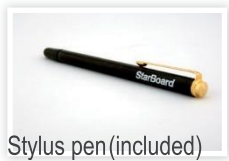
Stylus pen (included)